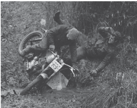
Nose diving in Friday Woods - myself grovelling in mud - clearly not cut out for sidecar duty.