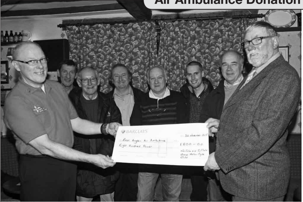
The Norfolk & Suffolk Group present a cheque for £800 to the East Anglia Air Ambulance