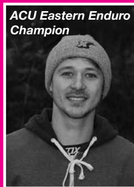
ACU Eastern Enduro Champion