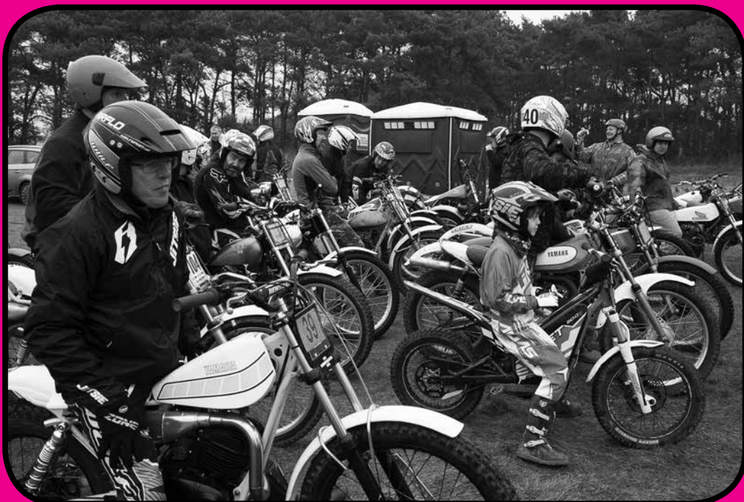
Riders prepare for the start of the Laurie Bird Memorial Trial