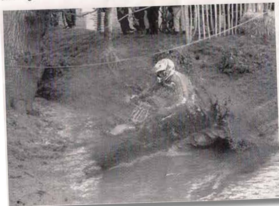
Stepping Mud Hole