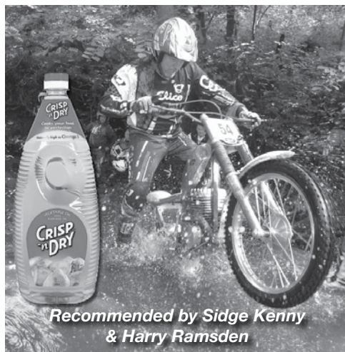
Recommended by Sidge Kenny & Harry Ramsden

Further reading on the subject informed me I had probably used the wrong vegetable oil. Cooking oil is likely to be extracted from rape seed or sunflower, whereas the scientists proclaim the best oils for engines are obtained from palm oil or soybean. Experiments have even been tried with a mixture – including mixing either with mineral oil, which in my day was considered a definite: “no-no”.