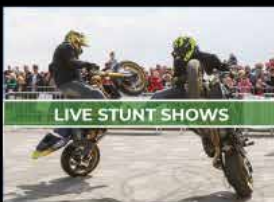
LIVE STUNT SHOWS