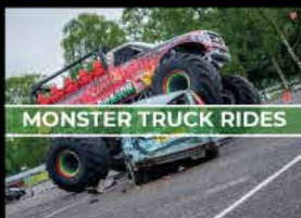
MONSTER TRUCK RIDES

7 th -8 th MARCH - KING'S LYNN STADIUM, PE34 3AG