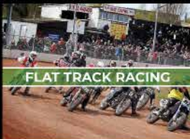
FLAT TRACK RACING