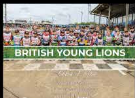
BRITISH YOUNG LIONS