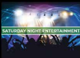
SATURDAY NIGHT ENTERTAINMENT