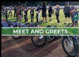
MEET AND GREETs