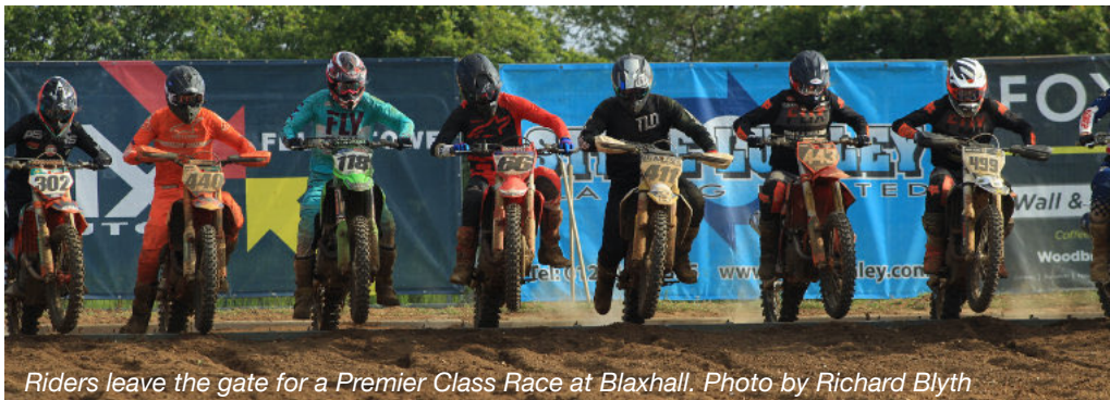
Riders leave the gate for a Premier Class Race at Blaxhall.