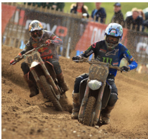
Watson (919) leads Herlings (84) in their fierce battle