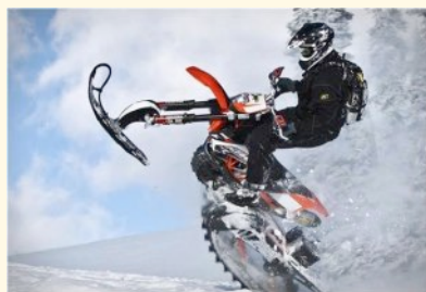
Photo right: some people will never let the snow keep them off their beloved bikes!

As time has passed on, many race venues themselves, have modernised as they were able to progress from simply hiring a field and perhaps having to remove livestock elsewhere on race day - to fully set up courses, specifically for racing. Including well surfaced paddocks with the ability to get in and out of them. Yet it has to be accepted that much of sport is still operated on a less well developed level and the variables such as weather and ground conditions will always have its unwelcome impact. Nothing is more annoying for all concerned than a meeting cancelled through not being able to get there and probably only a little less so, if you can't get out.