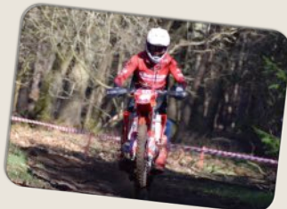
VIEW FROM THIS SIDE