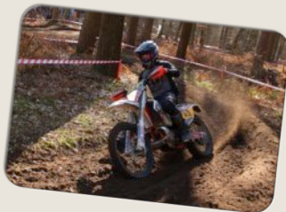
VIEW FROM THE