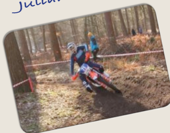
VIEW FROM THIS SIDE