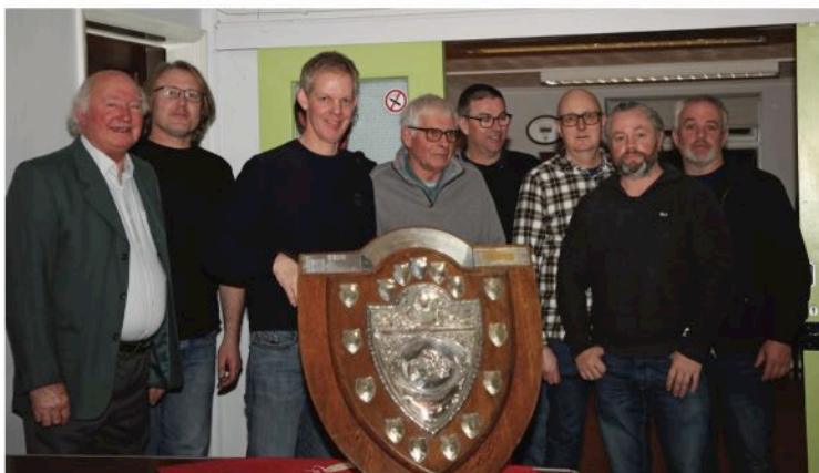
Ipswich Motors Award - Inter Club Championship Shield. Ipswich Members.