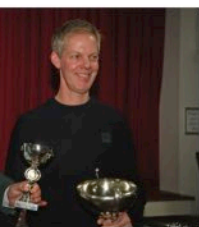
on Cobb Trophy - Experts Trial. n Harvey.