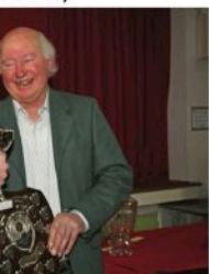
by - Youth Expert. Lowen