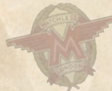
Jack Hubbard (#5)